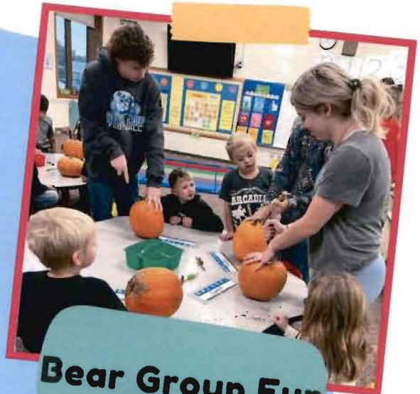
Bear Group Fun